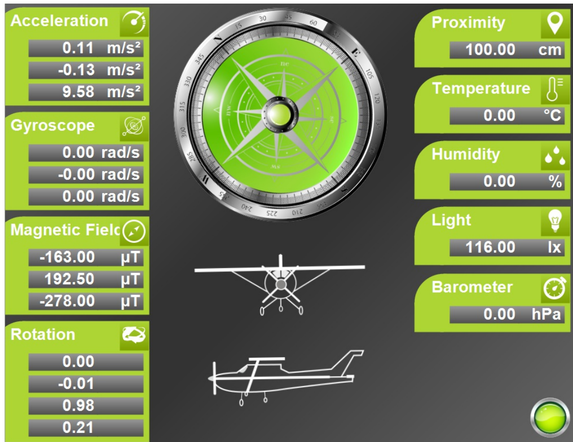
Screenshot: Representation of sensor data in the CODESYS Development System (AndroidSensorApp.project)